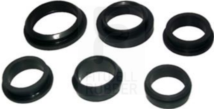
Rubber Ring Grommets