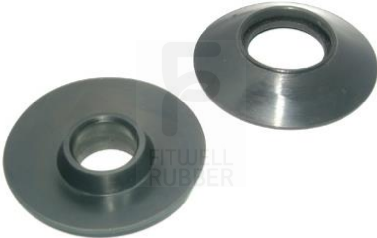
Rubber Anti Drain Valves