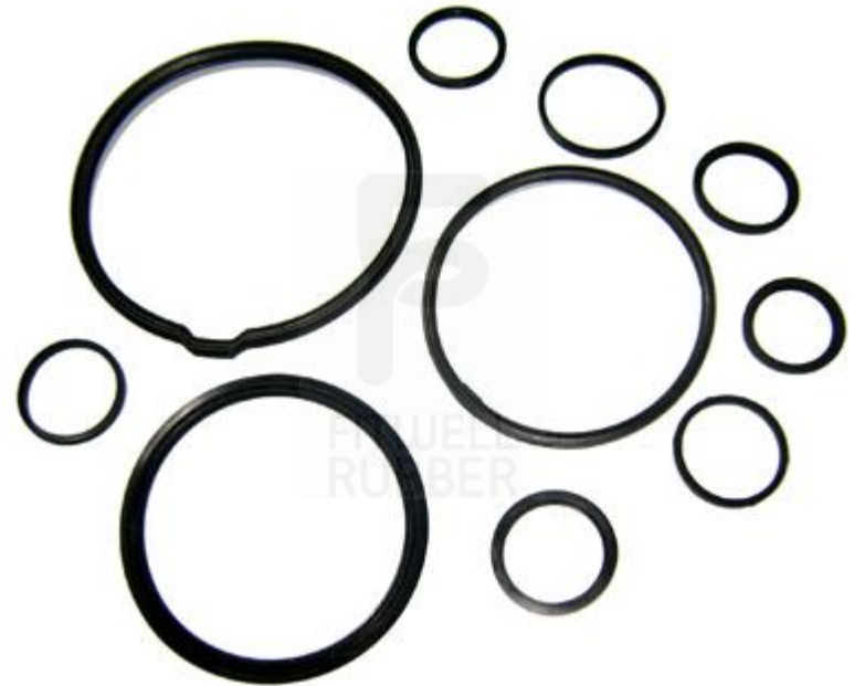
Circular Rubber Gaskets