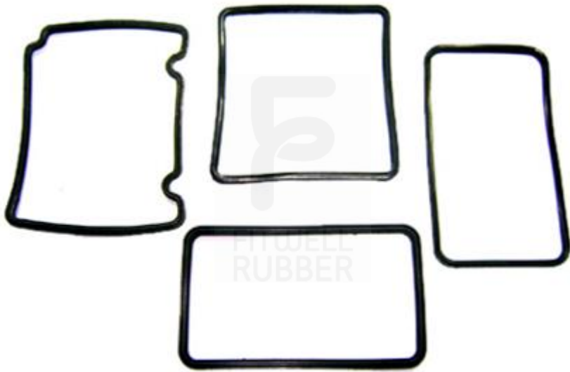
Rectangular Rubber Gaskets