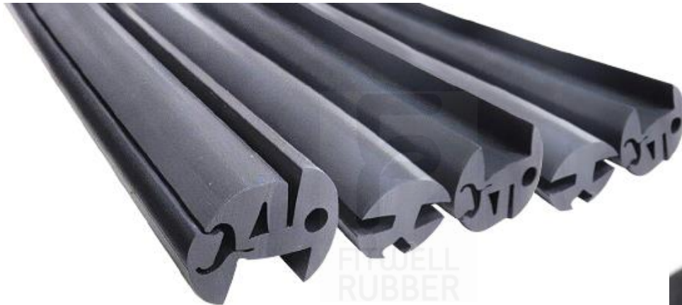
Rubber Extrusion Profile