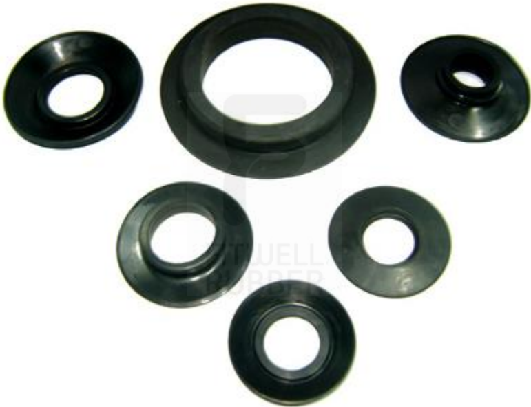
Rubber Check Valves